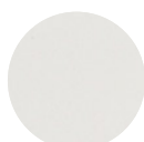
Matt Optic White