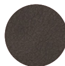
Faux Leather Vintage Ebony