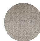
Venice Velvet Sand