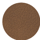
Faux Leather Vintage Tobacco