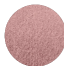
Venice Velvet Pink